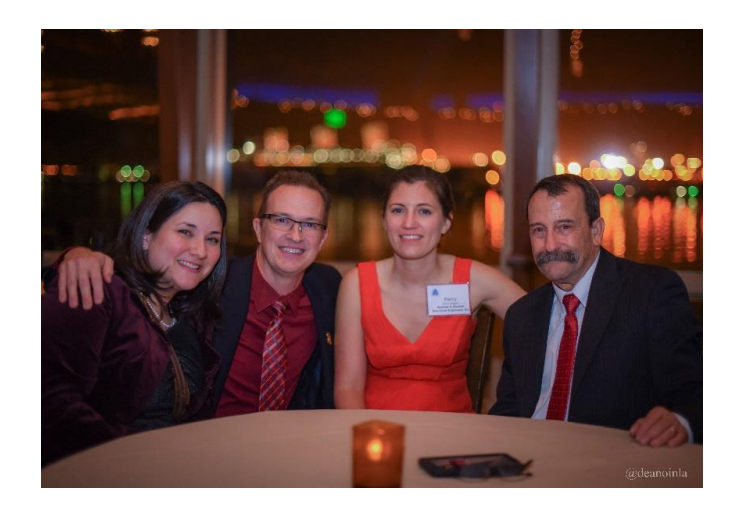
SEAOSC Holiday Event <a href="Click Here">Click Here</a> to view the Event Gallery